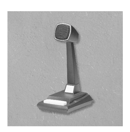
Figure 1 (on reverse) depicts the V-400 connected to the Valcom V-9939A microphone adapter.