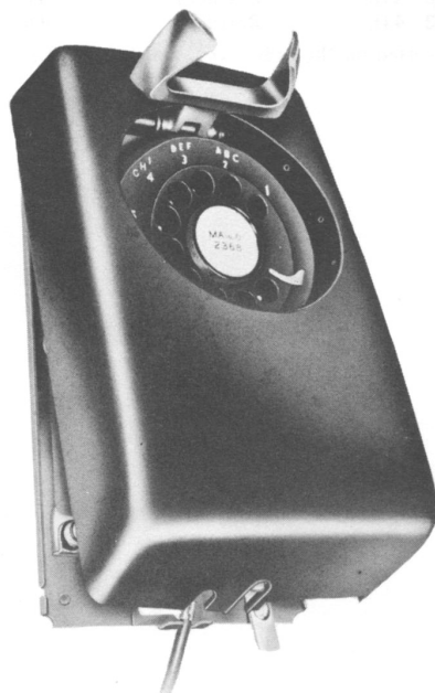
Fig. 2—Exterior View