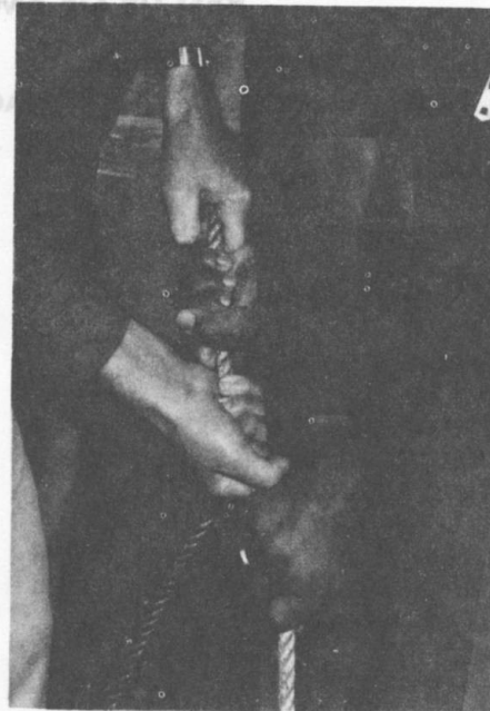
(B) RESCUERS CHANGING HAND POSITIONS