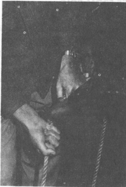
(A) INITIAL GRIP POSITION ON RESCUE ROPE