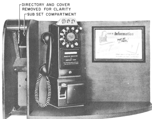
Fig. 1 — Singly Mounted 19-Type Shelf

2.02 Locate bottom of shelf 43 inches above floor level. When a lower mounting is necessary, such as in a veterans' hospital, the steel seat bracket (or a similar approved support) used in telephone booths should be placed under the shelf to guard against possible damage to the shelf should someone use it as a seat.