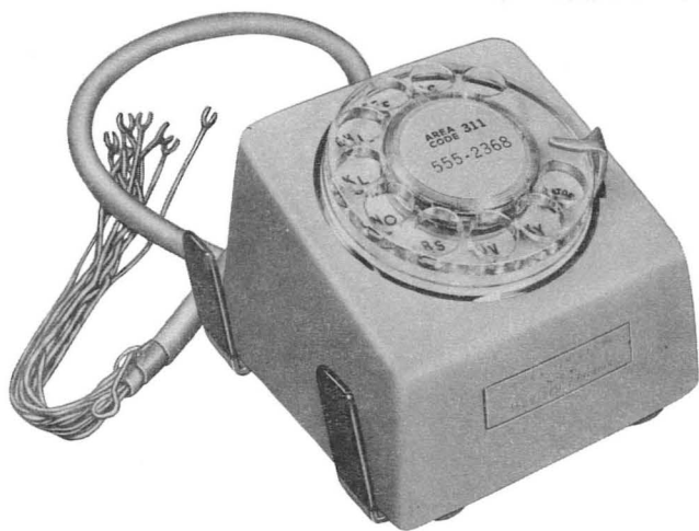
Fig. 1—1008B Type Dial

2.01 The 1008B-type dial (Fig. 1) consists of an 8B rotary dial in a special molded housing containing terminations for a D10R cord (1 foot 4 inches) which is used to connect it to an adjacent telephone set.