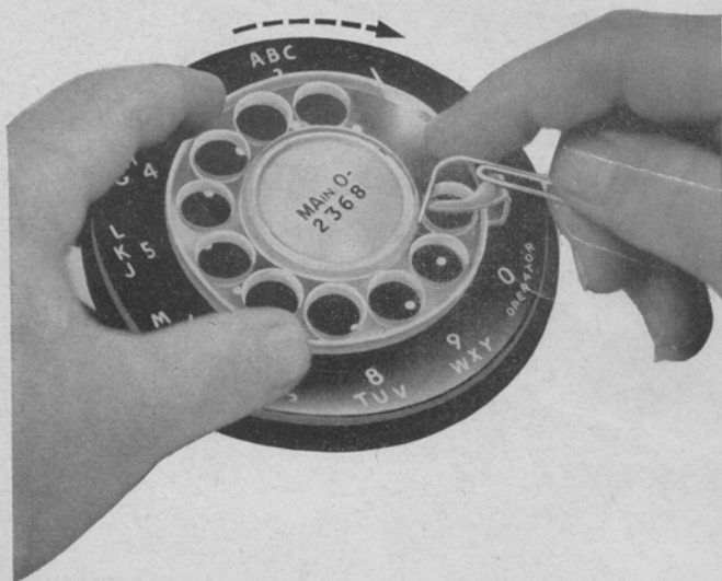
Fig. 16—Removing Plastic Finger Wheel