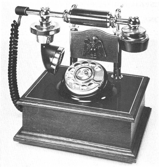
Fig. 3—CS881C104 DESIGN LINE Decorator Telephone