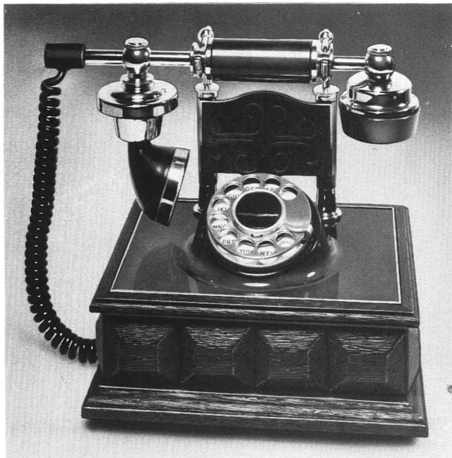
Fig. 2—CS881C103 DESIGN LINE Decorator Telephone

†Trademark of American Telephone and Telegraph Company.