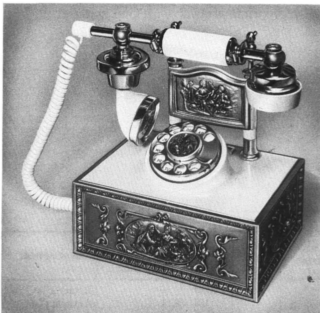
Fig. 1—CS881C102 DESIGN LINE Decorator Telephone

1.01 This section contains information on the CS881C102 (ANTIQUÉ GOLD* cradlephone, Fig. 1), CS881C103 (MEDITERRANEAN* cradlephone, Fig. 2), and CS881C104 (EARLY AMERICAN* cradlephone, Fig. 3) DESIGN LINE † decorator telephones.