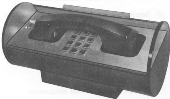
Fig. 1—2911A1-03 Telephone Set with Cover Open

1.02 Whenever this section is reissued, the reason for reissue will be listed in this paragraph.