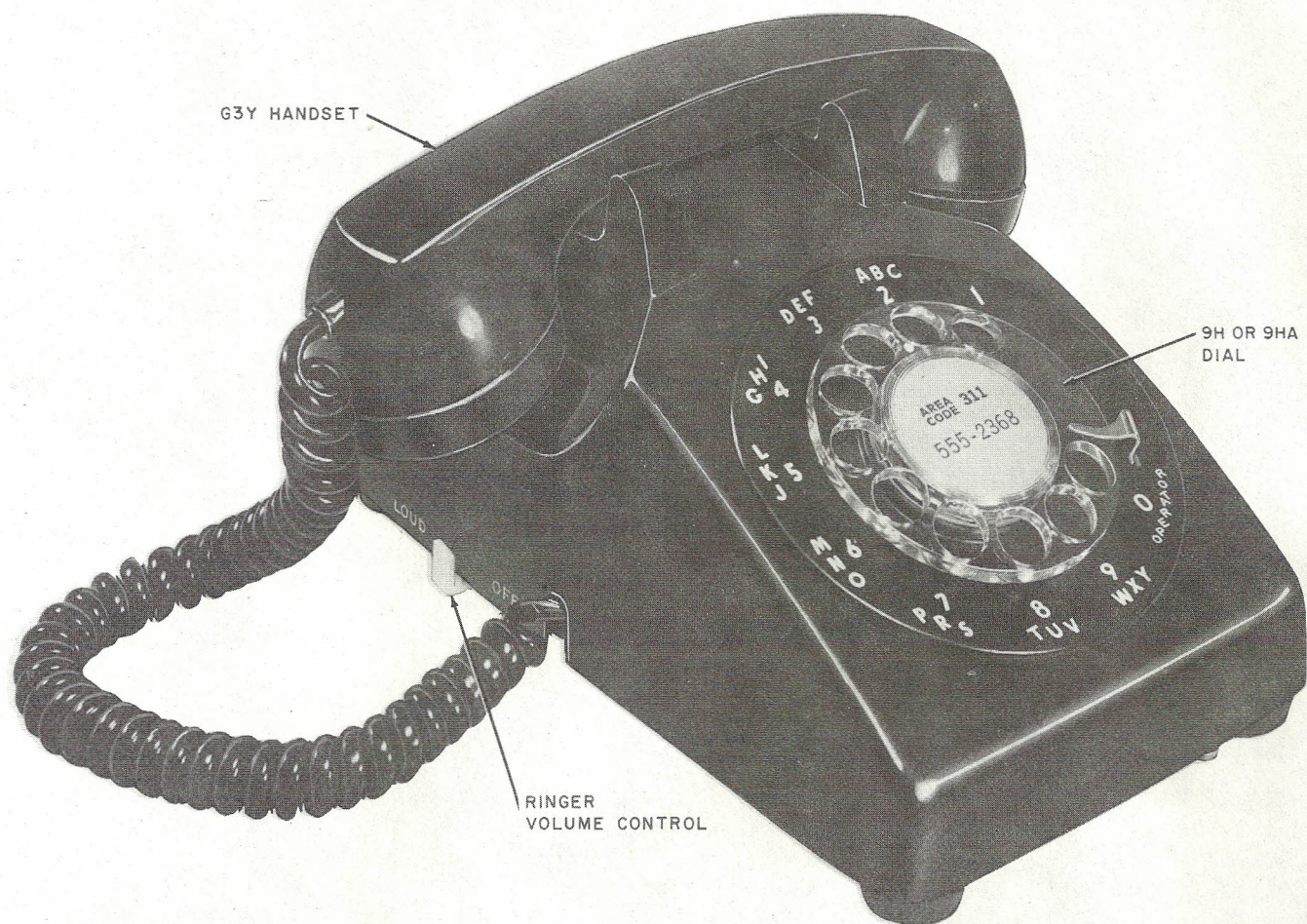
Fig. 1—500AB Telephone Set

3.04 The set mounting cord is plug ended to mate with the system cabling connector or 66-type connecting block.