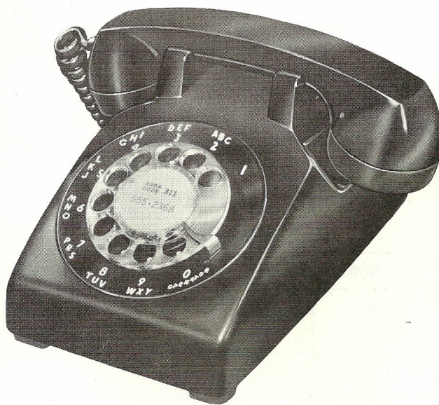
Fig. 1—529B Telephone Set

1.01 The 529B telephone set (Fig. 1) is a rotary dial desk-type set intended for use with 101- and 102-type key equipment. Illustrations used in this section are of shop models; production sets may differ slightly.