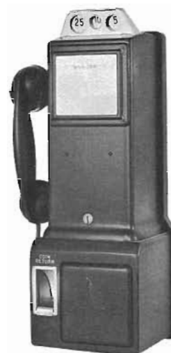
FIG. 1—182C, D MANUAL SET

2.02 The 182C and D type sets require a subscriber set equipped with a ringer only.