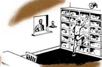
STOCK ROOM SERVICE CAN BE IMPROVED, TIME SAVED FOR OTHER WORKERS

In most filing departments, clerks are constantly walking between the files and the telephones at their desks. With a Paging Telephone, however, they can read and transmit information directly from the files —providing information faster—easily handling several times as many inquiries.