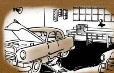
MECHANICS AND OTHER MANUAL WORKERS REMAIN AT PRODUCTIVE WORK

Throughout extended warehouse areas, Paging Telephones provide immediate communications. They speed the issuing and confirming of orders, the identifying of merchandise in stock, and the scheduling of its movement. You're always in touch with every crew wherever they're at work!