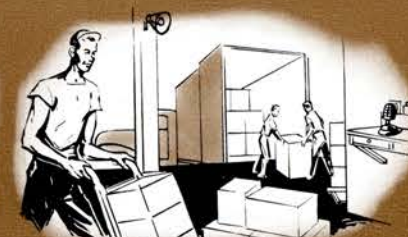
RECEIVING ROOMS AND LOADING PLATFORMS, FIND PAGING TELEPHONES INVALUABLE

When you place a call to a man who is underneath a truck, or to a man at work on a machine, he ordinarily must leave the job in order to answer your telephone call. But not when you call him over a Paging Telephone—the hands of the called party need not be empty nor necessarily clean!