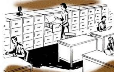
FILING DEPARTMENTS NOW HANDLE MANY MORE CALLS

In most filing departments, clerks are constantly walking between the files and the telephones at their desks. With a Paging Telephone, however, they can read and transmit information directly from the files —providing information faster—easily handling several times as many inquiries.