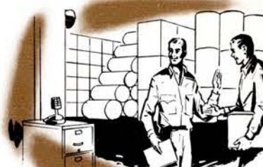
IN WAREHOUSE OPERATIONS, EVERY MAN CAN ACCOMPLISH MORE

Dispensing of supplies calls for frequent service to others, also for numerous telephone talks with Purchasing, Supervisors. Paging Telephones permit stockroom personnel to remain near the bins or shelves, to serve other workers promptly. The same for others in many different occupations.