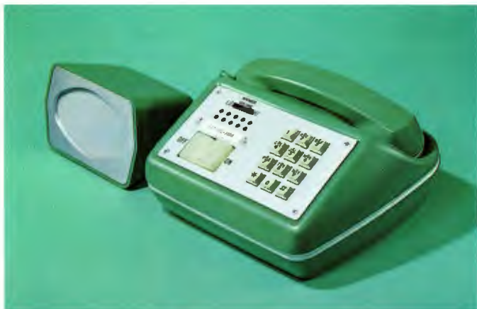
HANDS-FREE PHONE —You can carry on a telephone conversation without having to hold the handset. Great for taking notes or conferences.