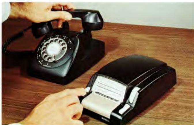
AUTOMATIC DIALER —Dials often-called numbers for you at the press of a button. No more wrong numbers.