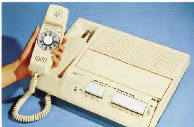
AUTOMATIC TELEPHONE MESSAGE RECORDING —Answers phones while you're out, records callers' messages—up to 24-hours a day, if you wish.