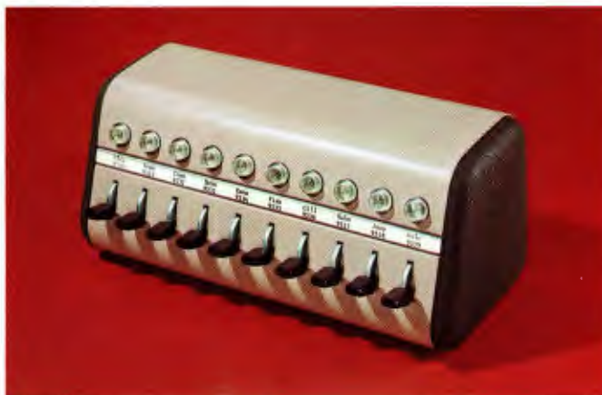
SECRETARIAL ANSWERING —For answering phones promptly. As many as 20 phones can be answered from one location.

These are some of the features we can provide in your communications system