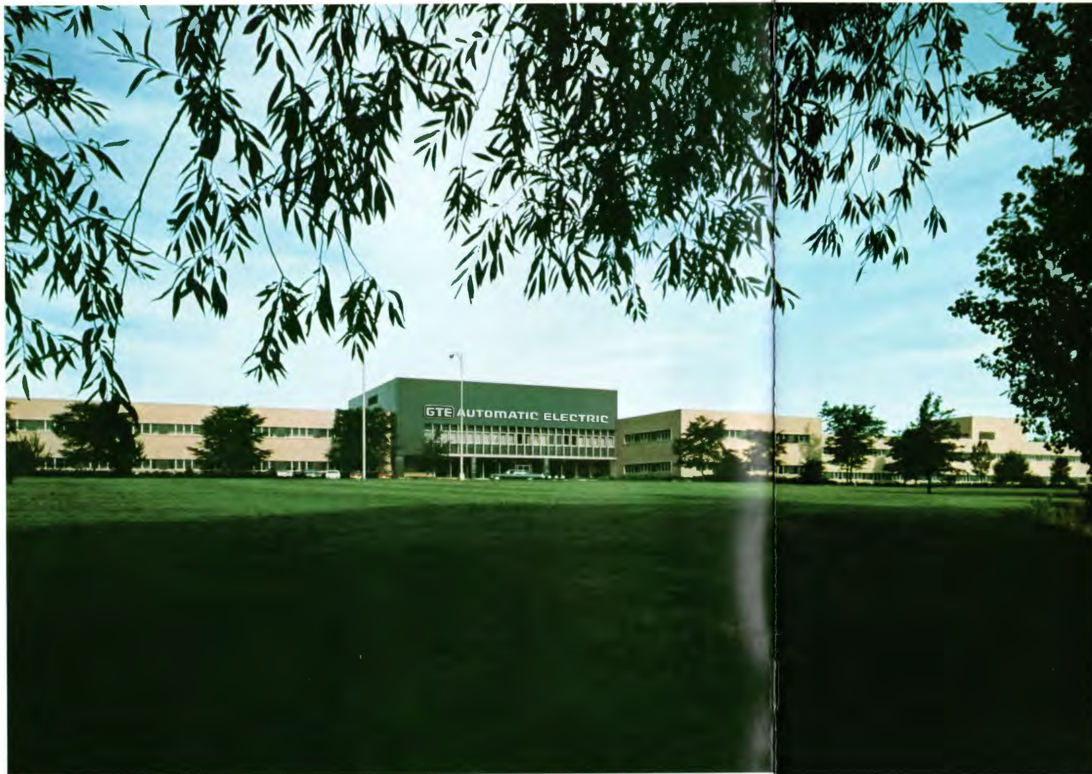
General offices and main manufacturing plant of GTE Automatic Electric, Northlake, Illinois. The company has over 3,500,000 square feet of floor space devoted to the manufacture of communication equipment