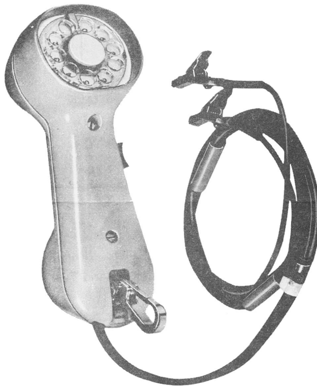
Figure 1. Type 801 Hand Test Telephone.

The Type 801 hand test telephone can be equipped with a variety of cords depending upon its application. For central office use, a resistor equipped test cord is furnished. The switch on this cord applies or removes 1500 ohms resistance onto the line on test. This resistance simulates a long line loop. The various cords and method of operating the hand test telephone are described in GTE Practice 100-203-100.