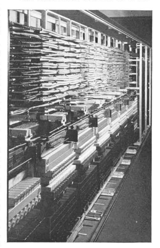
Fig. 2—A rear view of the new board shows the compact grouping of the relays on their steel supporting structure and the accessibility of the multiple

versal board was the difference in voltage requirement for the diverse classes of service. The 600 and 604 types of board both normally used low voltage batteries, but if they were equipped for long distance tie lines, 48 volts was required for transmission in addition. All dial apparatus used with boards of this size, however, is designed to operate on 48 volts so that the 700 PBX was arranged for this