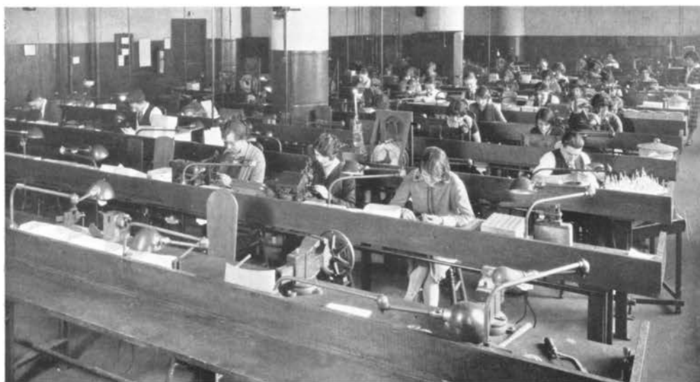
A section of the Assembly Department, where the elements of the tube are constructed and attached to the glass stem unit

In forming the seal the glass is heated to a temperature where it is sufficiently plastic to be pressed around the four lead-wires. If these lead-wires are not specially shaped where they go through the glass, it is necessary for them to expand just like the glass under temperature changes.