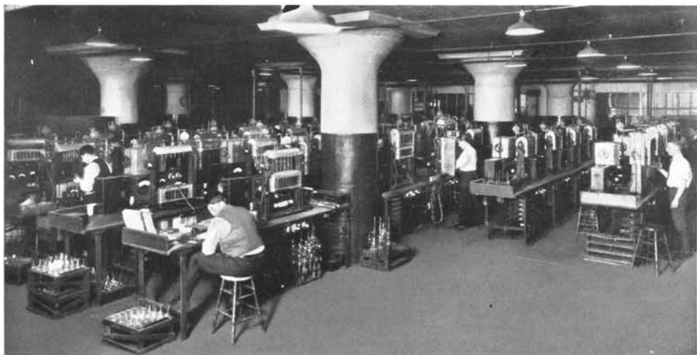
A section of the Vacuum Pump Department

all ten wires can be simultaneously inserted. The arbor is heated at the points where the wires are to be inserted. When the operator sees that the glass is heated sufficiently, he moves two levers which advance the ten wires to the proper depth in the glass. By his next movement of the levers the ten wires are cut to proper length, and the fires turned out.