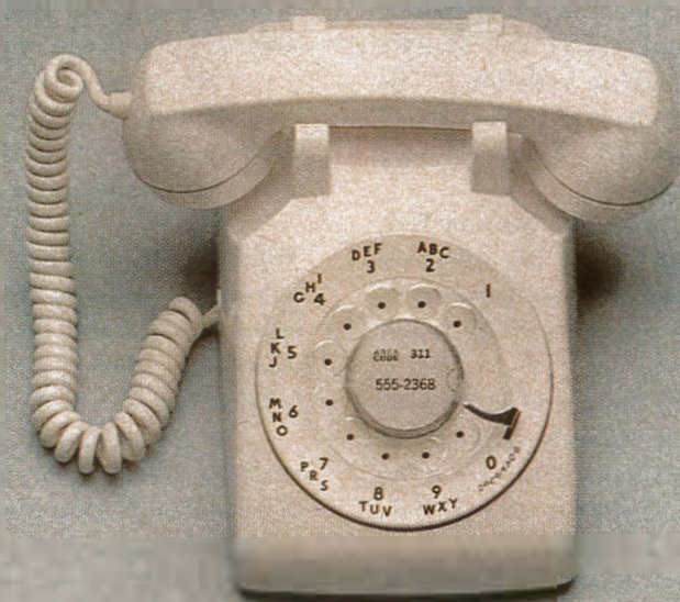
Handy Desk Phone