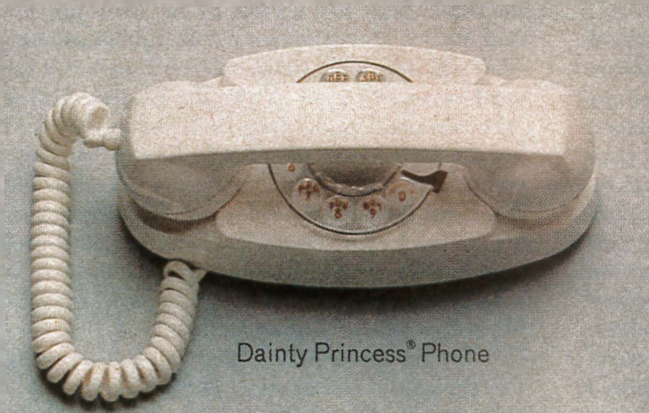
Dainty Princess® Phone