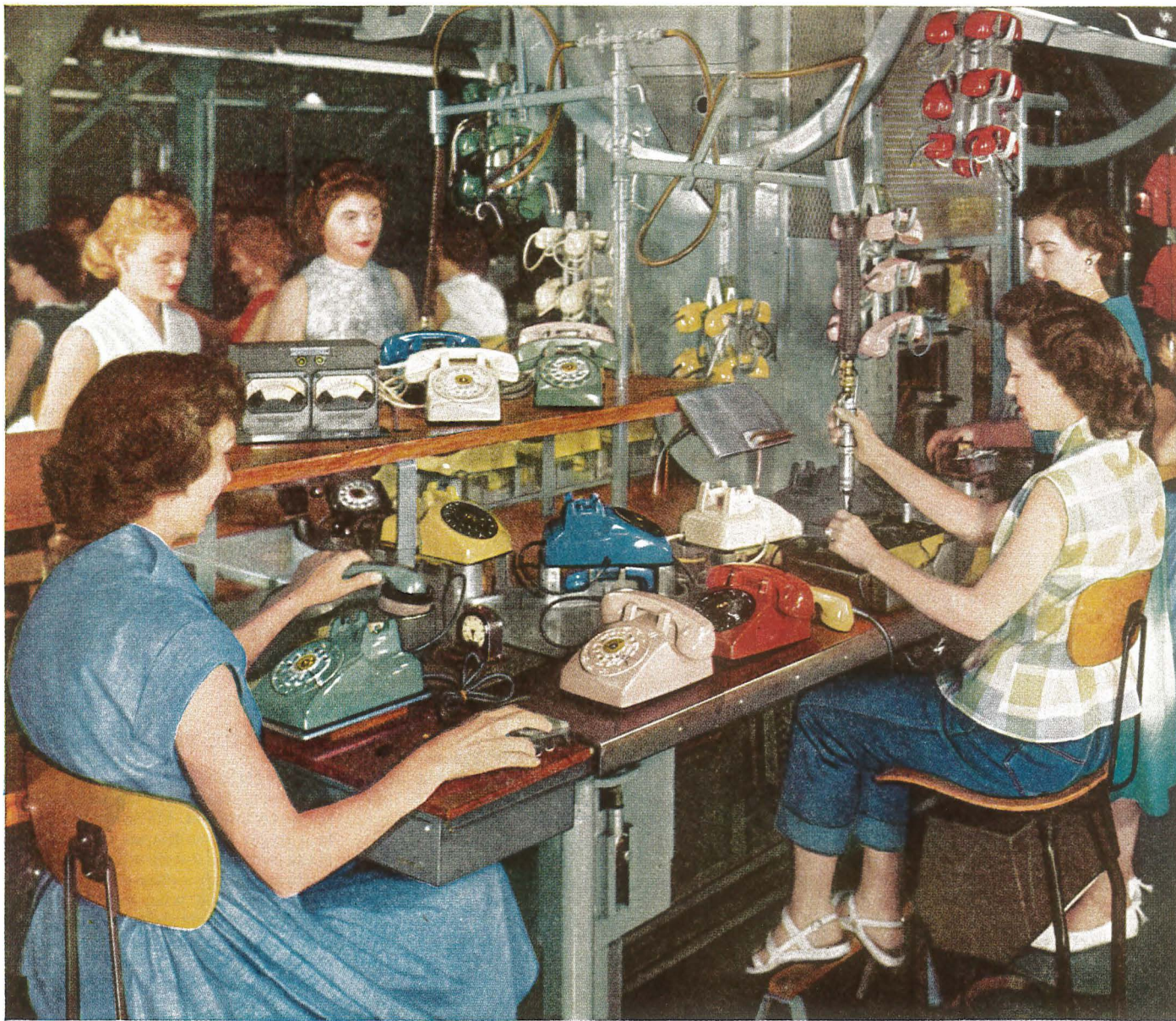
Here they come: full color telephones reach test station on one of the production lines in Western Electric's Indianapolis factory.