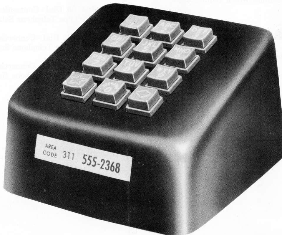
Fig. 1 — 1035B3 or F-56309 Dial