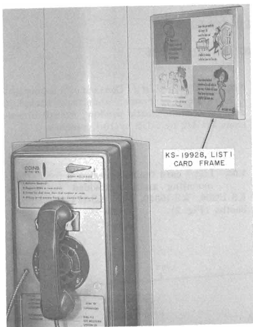
Fig. 2 — KS-19928, List 1 Card Frame Mounted on a Flat Wall

1.05 KS-19928, List 2: Consists of the same items as List 1 plus a 2-inch thick wedge-shaped mounting bracket (B-697116) (Fig. 1) used for mounting the card frame in the corner of KS-14611, KS-19425, and KS-19580 telephone booths (Fig. 3).