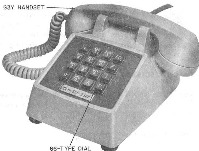
Fig. 1—3504-Type Telephone Set