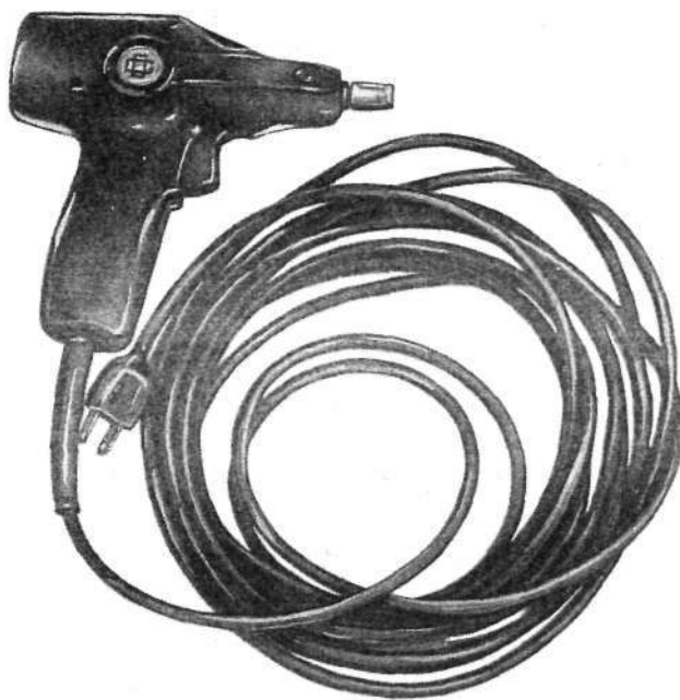
Fig. 3—KS-21232, L1, Electric Wire-Wrapping Gun