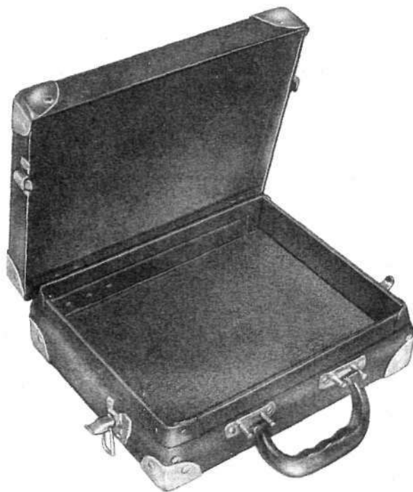
Fig. 4—KS-21232, L10, Case

1.08 Part 3 of this section covers the approved procedures for the replacement of parts listed in Part 2.