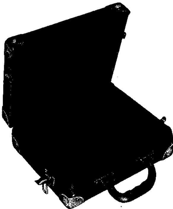
Fig. 4—KS-21232, L10, Case

1.08 Part 3 of this section covers the approved procedures for the replacement of parts listed in Part 2.