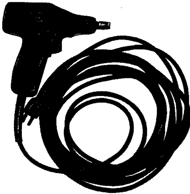
Fig. 3—KS-21232, L1, Electric Wire-Wrapping Gun