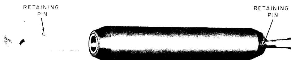
Fig. 2—B Protector Tool—Inserting Section Removed