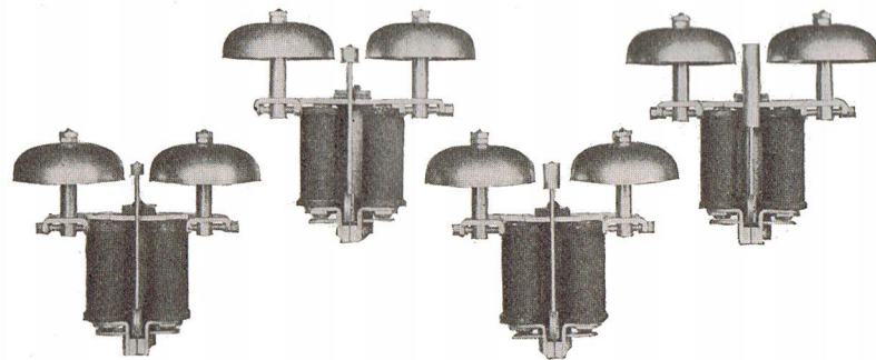
Four No. 73 ringers, one of each frequency as used in Kellogg direct harmonic system.

This system rings each telephone separately and does not "slop" over, whether there are four, five, eight or ten telephones on the line.