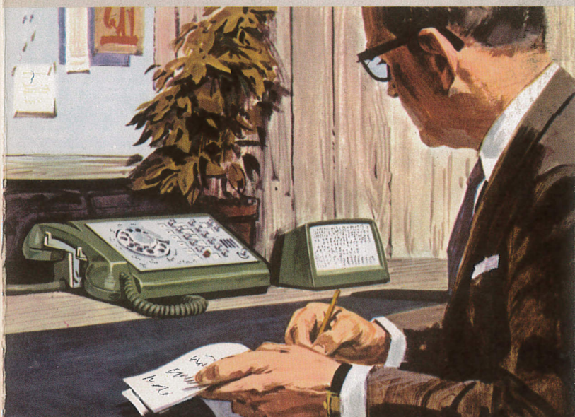
SPEAKERPHONE MODEL lets you take notes, look up records or relax while you talk. Groups in your office can join in telephone conversations.