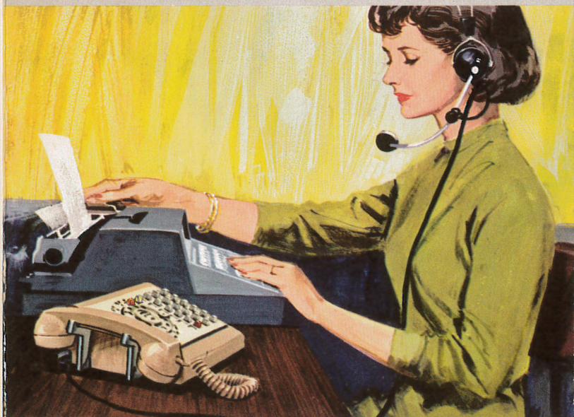
PLUG-IN HEADSET MODEL lets workers telephone "hands-free" while they take notes, consult records. Helps increase output, reduce errors.