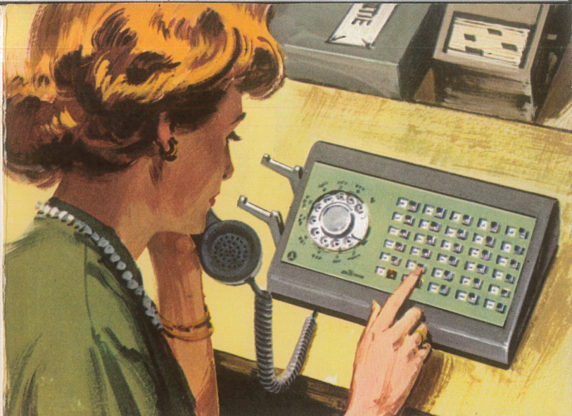
CALL DIRECTOR telephone permits one person to "cover" all telephones whenever necessary. Shown is 30-button model.