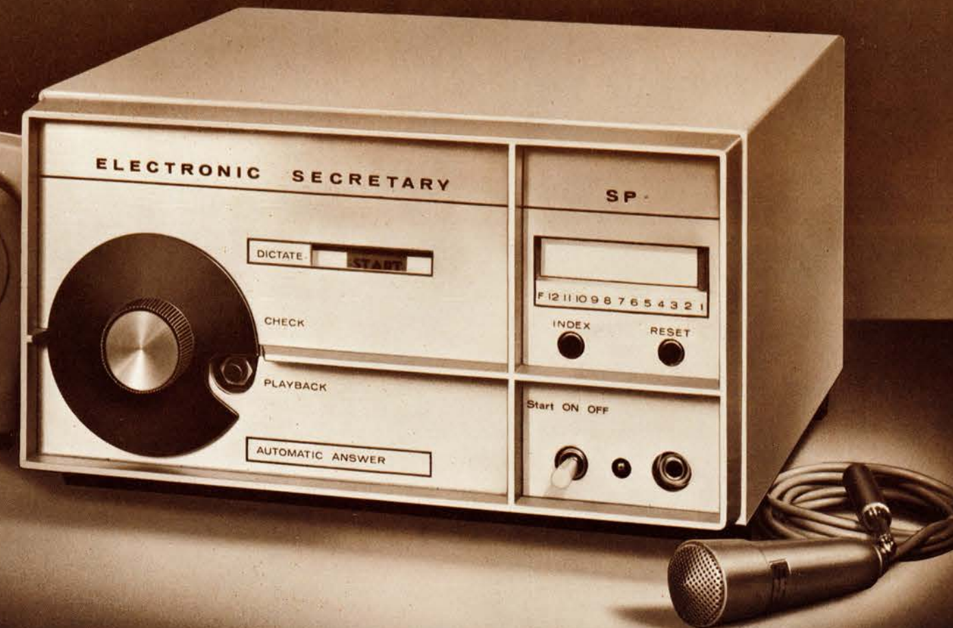
Model SP-2 ELECTRONIC SECRETARY® telephone answering set