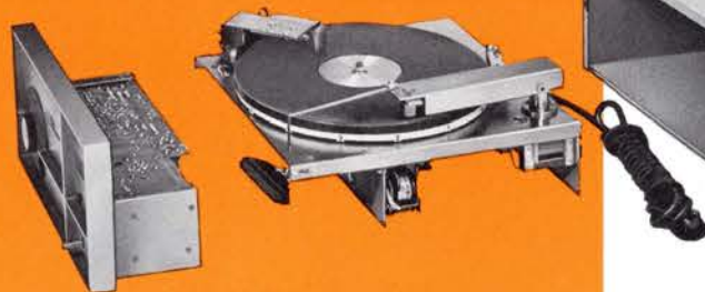
The exploded view of the machine assembly shows the control and electrical assembly, the mechanical assembly and the cabinet.

Note: The SP-2 employs a unit type of construction, in which any one principal sub-assembly can be removed from the main assembly without unwiring or using involved disassembly techniques.