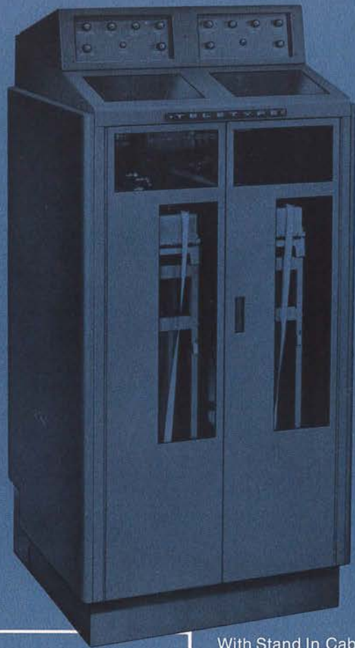
With Stand In Cabinet