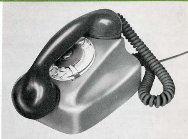
Desk Set, MI-38903.