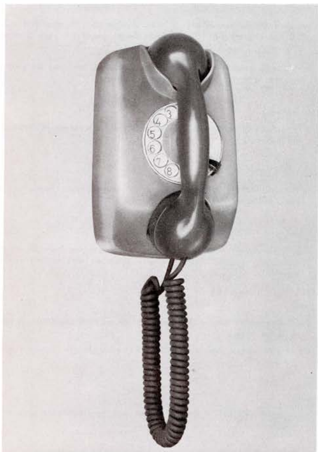
Wall Type, MI-38904.