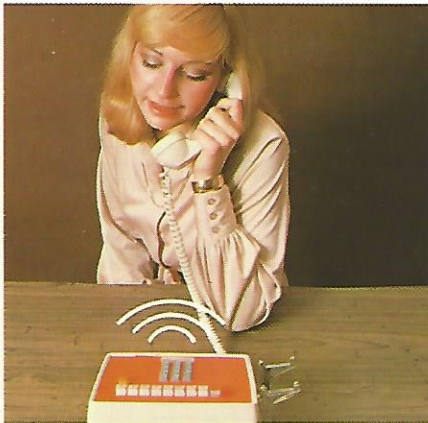
One-Way Voice Signaling on Intercom

The streamlined, compact Com Key* 718 system combines the best in modern telephones, intercommunications and paging in one flexible, efficient and economical package, designed for a maximum of seven lines and eighteen telephones. This system has deluxe features you may have believed were available only to complex installations. Consider these capabilities: