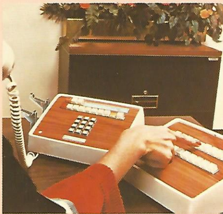
Direct Station Selection Consoles

Desk or Wall Telephones - 11 and 13 button Com Key 718 telephones are available in Touch-Tone® and dial versions.