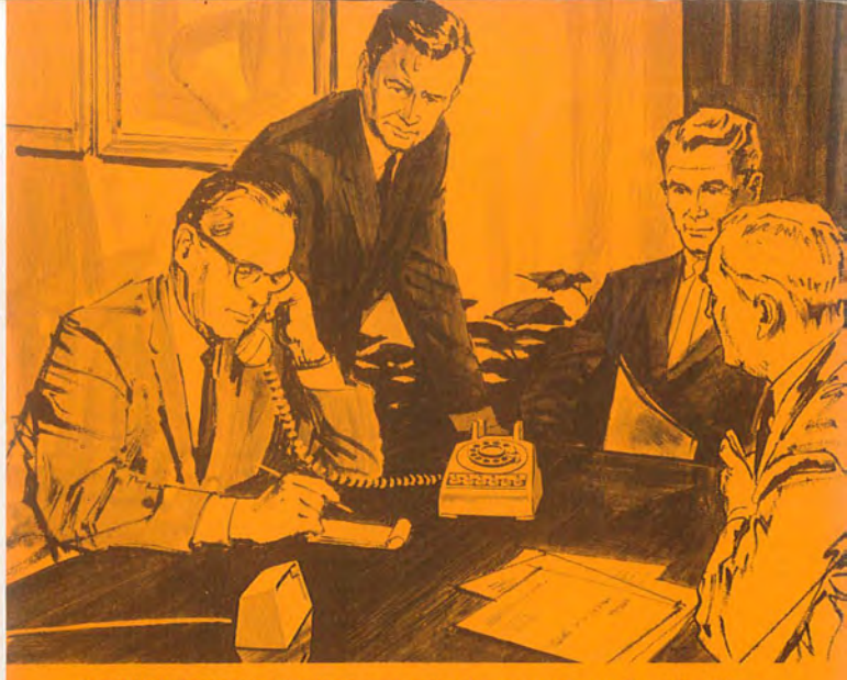
CONFERENCE-ROOM installation saves valuable time, promotes efficiency.