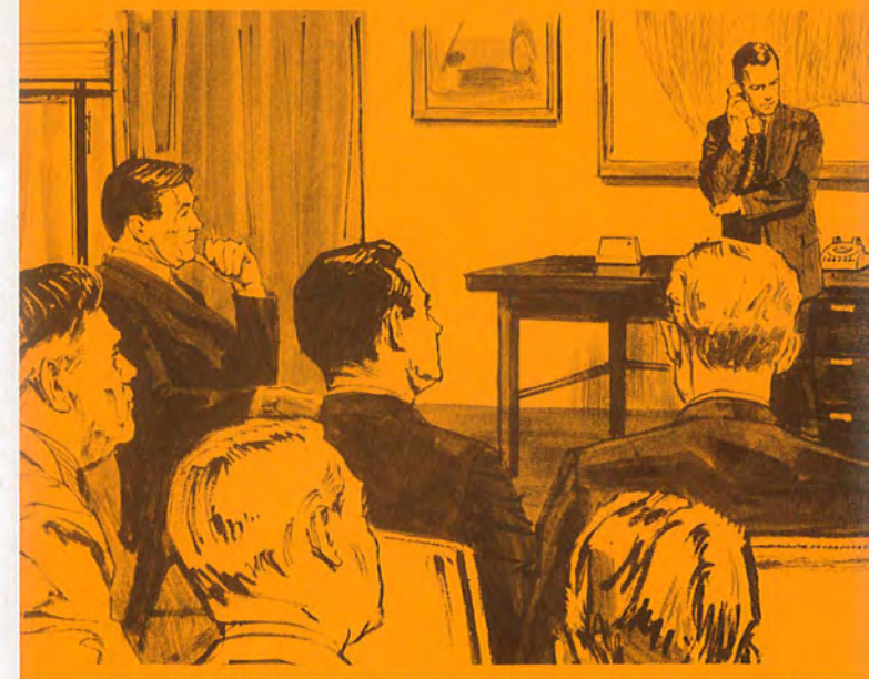
TRAINING-ROOM installation helps speed training and maintain high performance of all personnel.