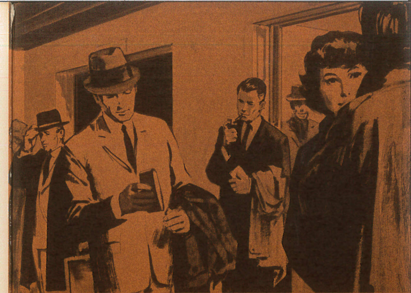
INDOORS: Bellboy in your pocket gives you the assurance that you can be notified in a moment if important developments occur.