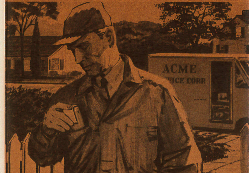
OUTDOORS: Bellboy spares servicemen the necessity of making unnecessary time-wasting “checking-in” calls or “backtracking” — makes their time more productive.