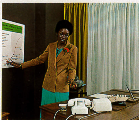
Keep on working and still take your call with Hands Free Answer.

Because of its many problem solving features, DIALOG Intercom offers you many time, space and step saving advantages.