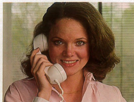
DIALOG Intercom insures Privacy of intercom calls.

With DIALOG Intercom, there is no need for all your phones to look just alike. You get the telephones that fit your exact requirements.