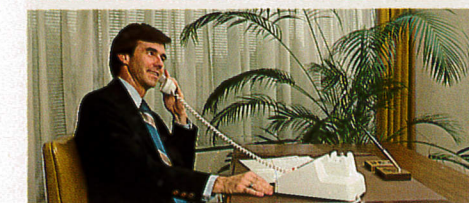
Dial your own conference; add on another party; transfer calls—all without assistance.

system capable of handling up to 52 intercom stations and 4 talking paths.