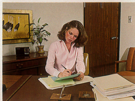
Do Not Disturb lets you work uninterrupted while someone else handles your calls.